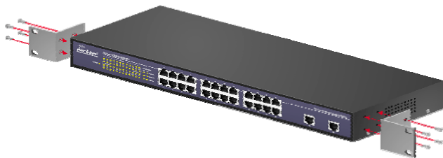
Figure 2. Combine the Switch with the provided screws

The Switch can be mounted in an EIA standard-size, 19-inch rack, which can be placed in a wiring closet with other equipments. Attach the mounting brackets to both sides of the Switch (one at each side), and secure them with the provided screws.