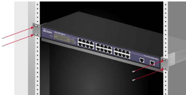
Figure 3. Mount the Switch in the rack

Then, use screws provided with the equipment rack to mount the Switch in the rack.