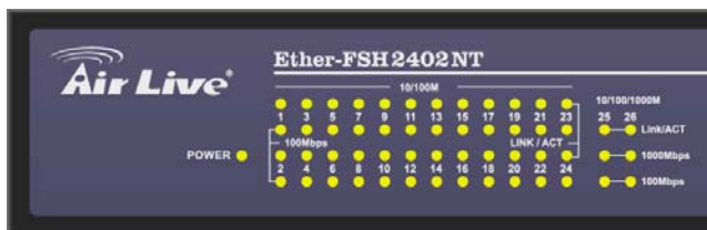
Figure 6. LED indicators of the Switch

The front panel LEDs provides instant status feedback, and, helps monitor and troubleshoot when needed.